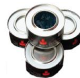
固体酒精 Solid alcohol