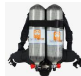
潜水器材 Diving equipment