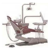
医疗器械 Medical instrument