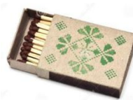
安全火柴 Safety matches